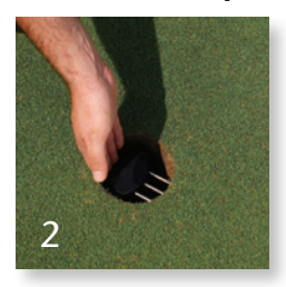
Insert sensor into hole