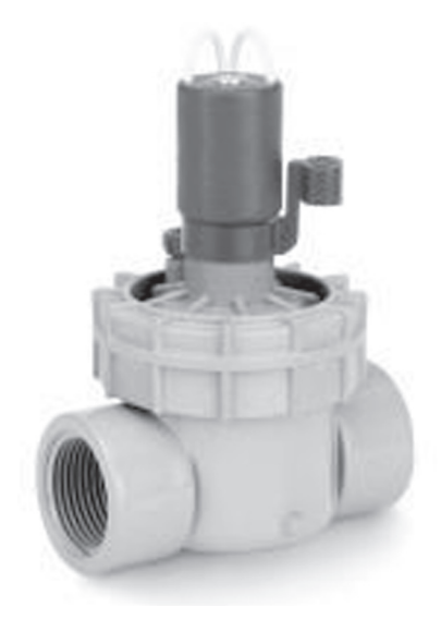
Solid construction, reliable performance, convenient operation.