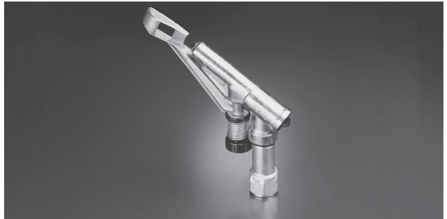
For medium pressure applications.