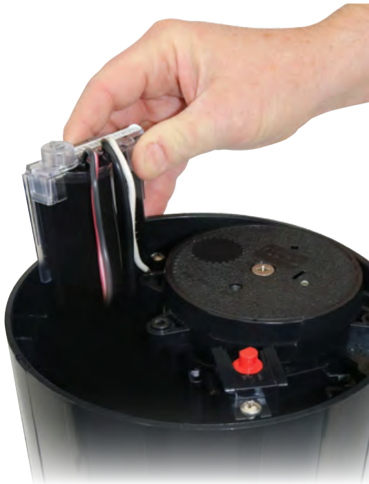
Toro INFINITY® sprinklers can be ordered with integrated LSM modules.