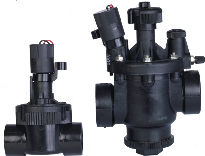
EZ-Flo* Plus and P-220 valves shown with the DCLS-P Latching solenoid, provide cost and labor savings.

Easy installation of two 9V batteries with the simple screw ON/OFF lid. The battery cap provides a dependable leak-proof seal allowing submersion up to 2m per IP-68.