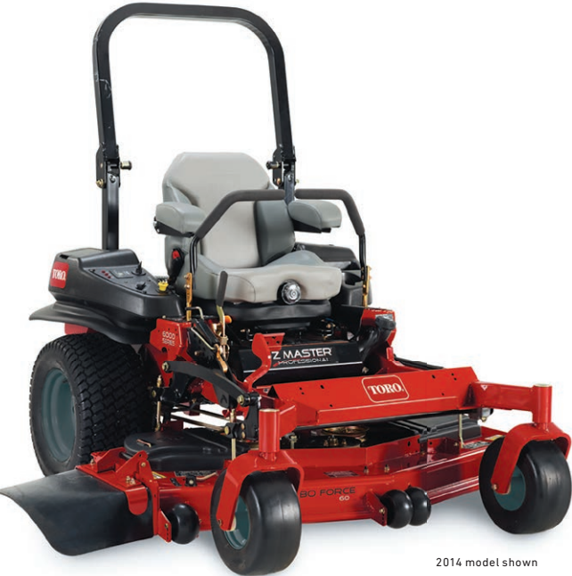
2014 model shown

An onboard intelligence platform that improves fuel efficiency, productivity, protects your engine and extends clutch life.