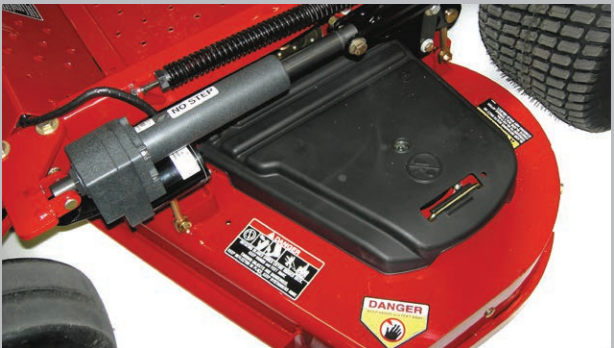
Electric Deck Lift

Excludes Z Master 8000® Series Direct Collect Z. Electric deck lift is not available for Z Master® Professional 7000 Series.