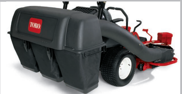
E-Z Vac Twin and Triple Bagger